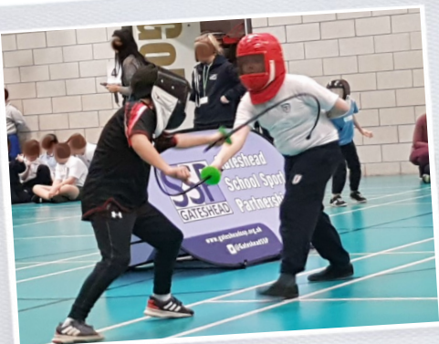
Children taking part in a mini fencing event, part of the COMPETITION PROGRAMME.