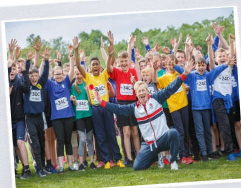
Children taking part in FLAGSHIP event, the Gateshead Schools Fun Run.