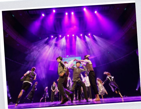
Children performing at a FLAGSHIP event, the Gateshead Schools Dance Festival @ Sage Gateshead