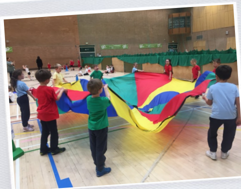
Children taking part in a dedicated Key Stage One event as part of the COMPETITION PROGRAMME.